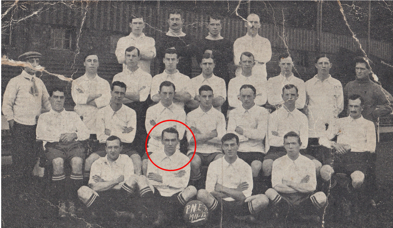
Preston North End 1911-12