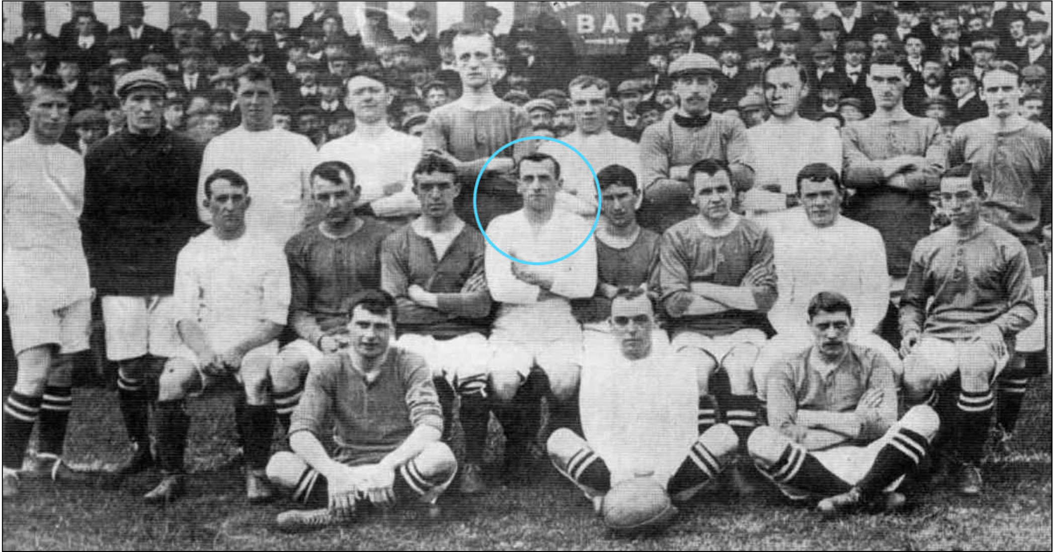
Manchester City 1906-07