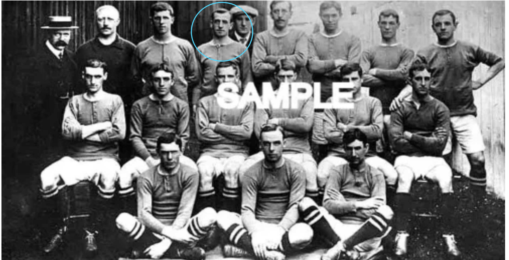
Manchester City 1905-06