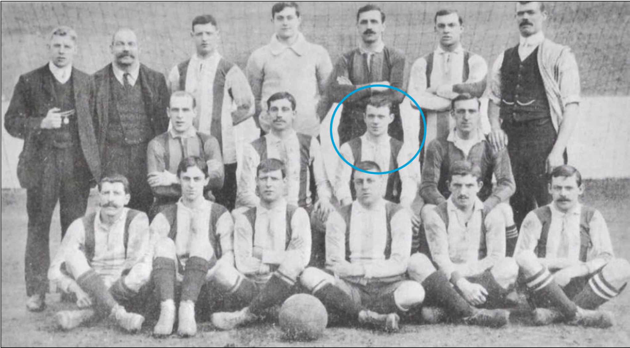
Clapham Orient 1905-06