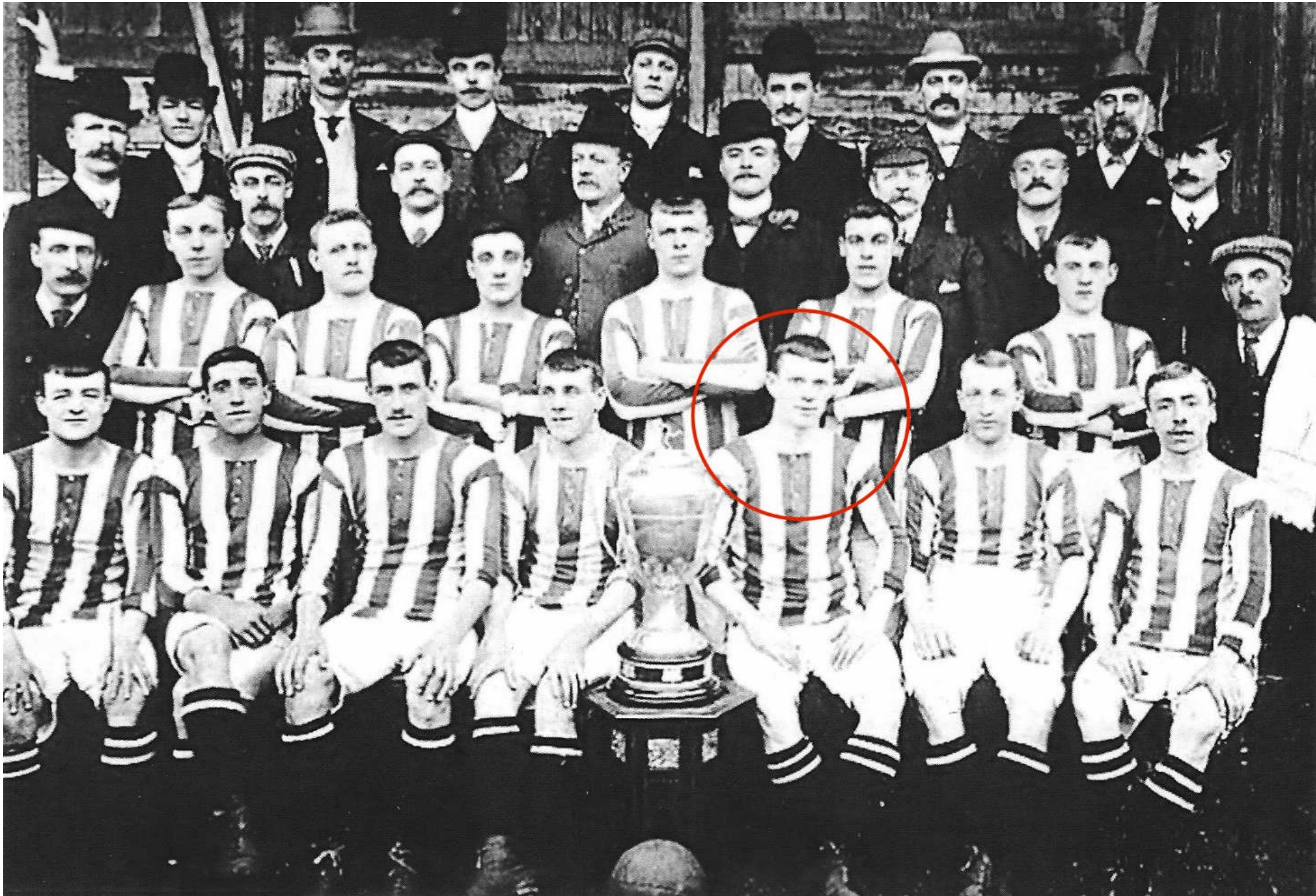
Stockport County 1904-05