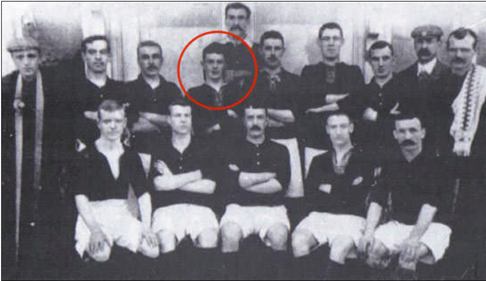
Swindon Town 1901-02

Signature Rowland Codling Postal Address 36 Larkhill Rd Stockport