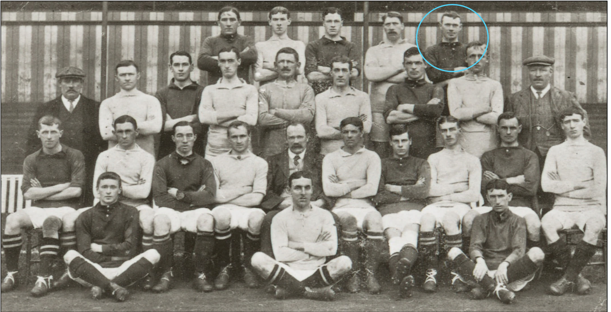
Manchester City 1910-11