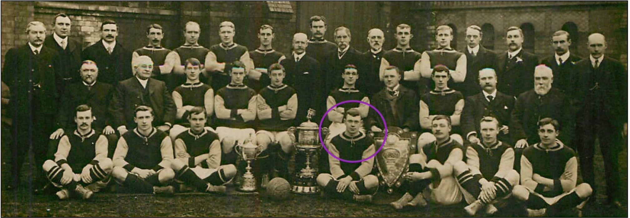
Aston Villa 1906-07