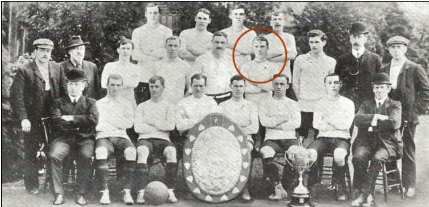
Northampton Town 1909-10