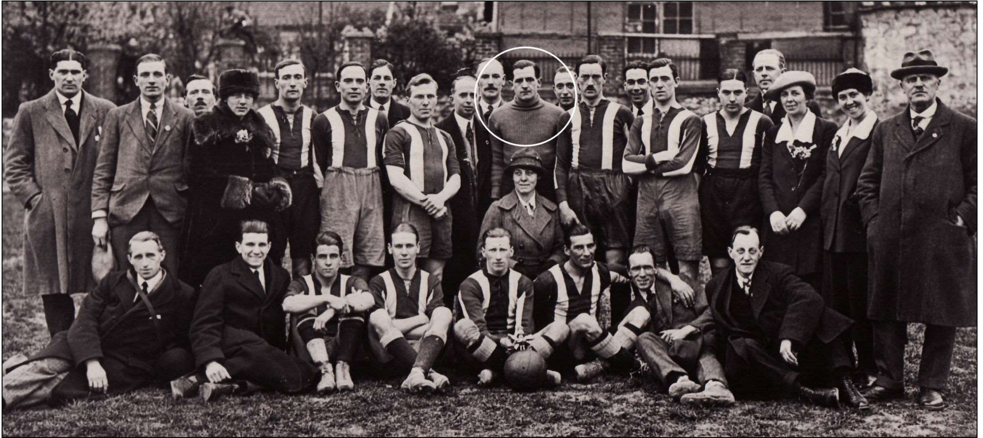
A Dulwich Hamlet touring party in France in 1921