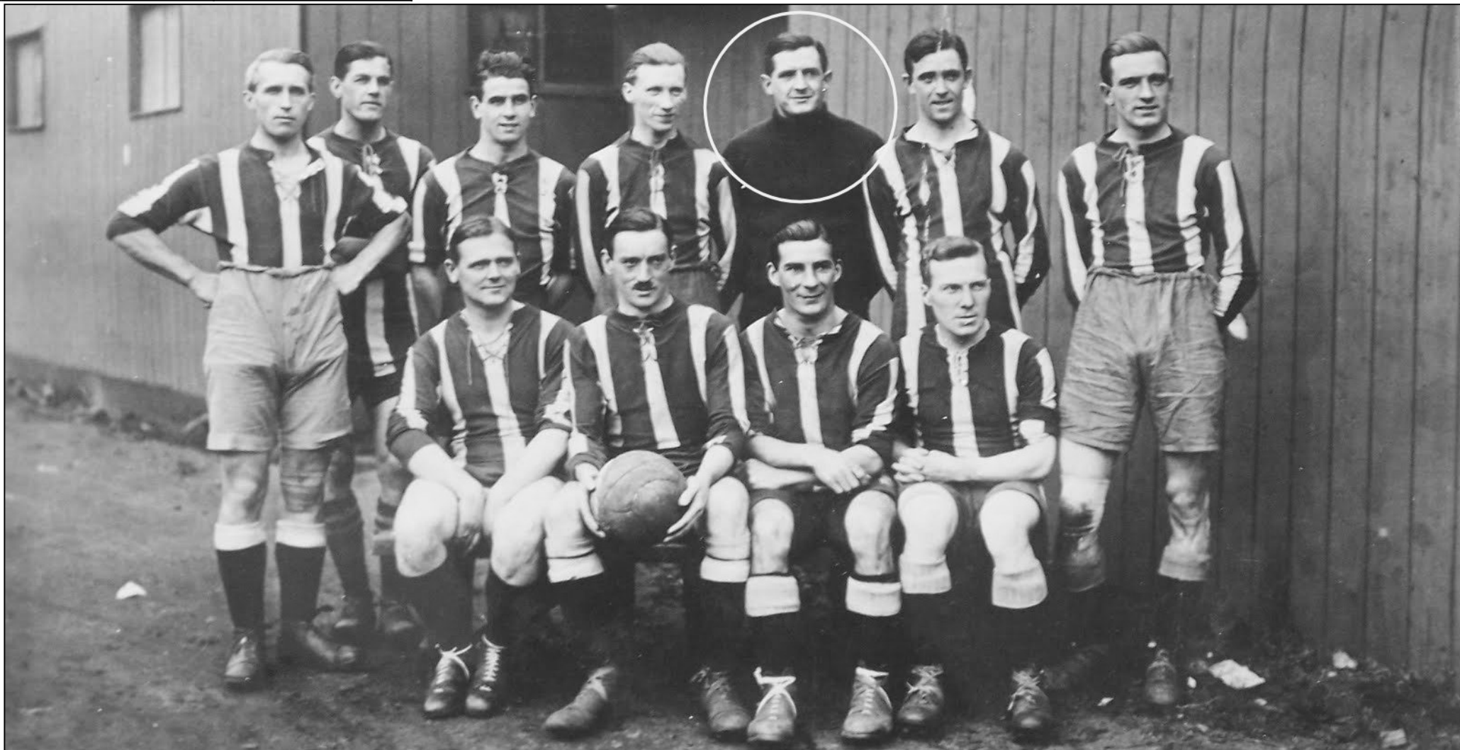
With Dulwich Hamlet