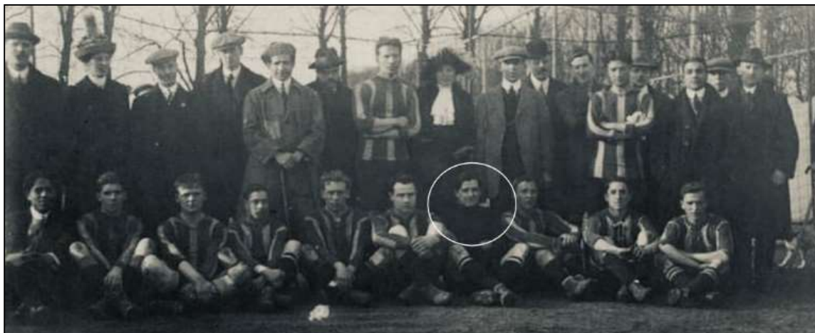
The Dulwich Hamlet side that beat Be Quick Nijmegen 2-0 on 24 March 1913