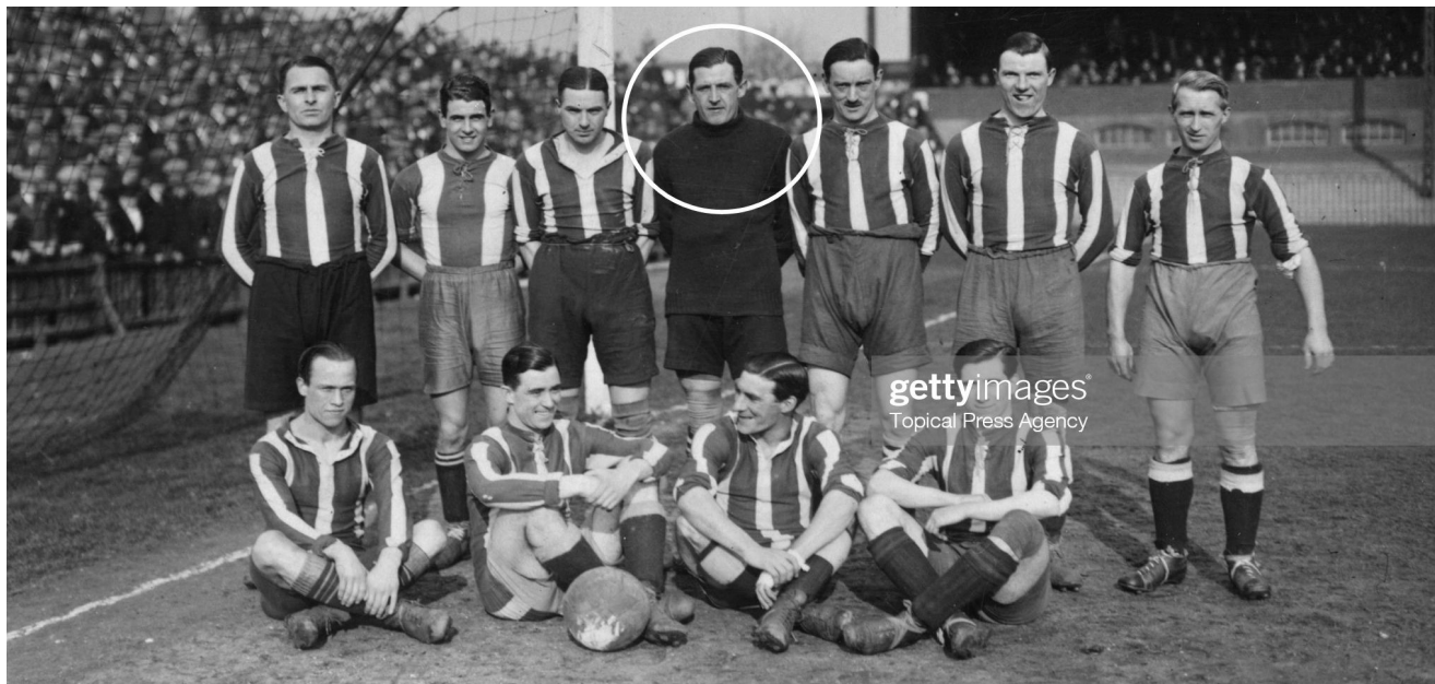
Dulwich Hamlet 1922 - Prior to the Amateur Cup Semi-Final with Bishop Auckland