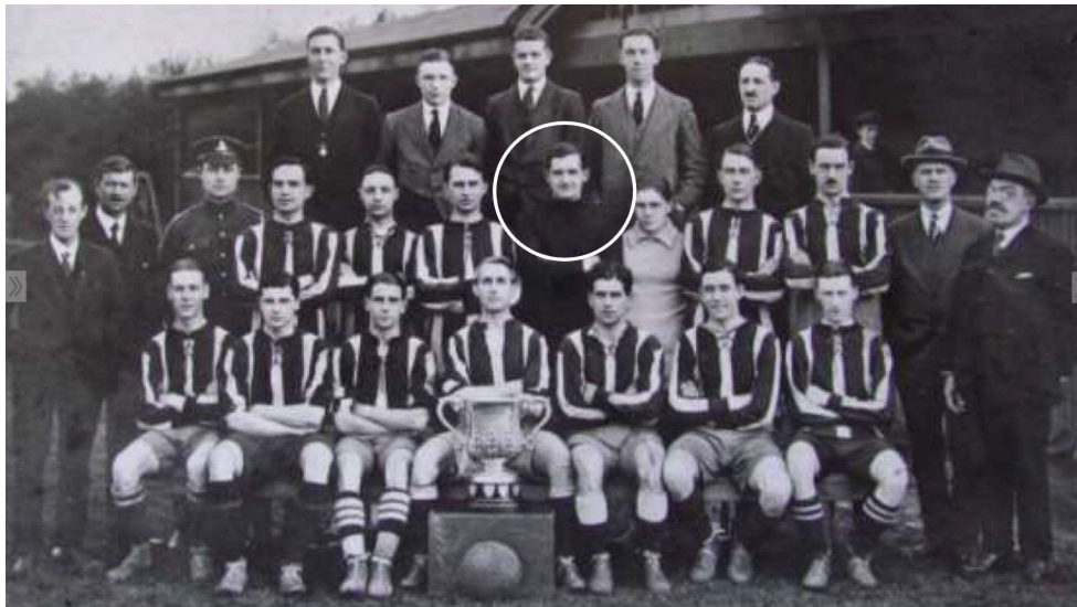
Dulwich Hamlet 1918-19