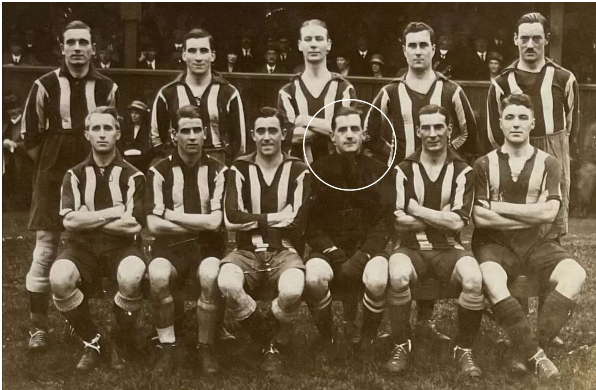
Dulwich Hamlet c.1922