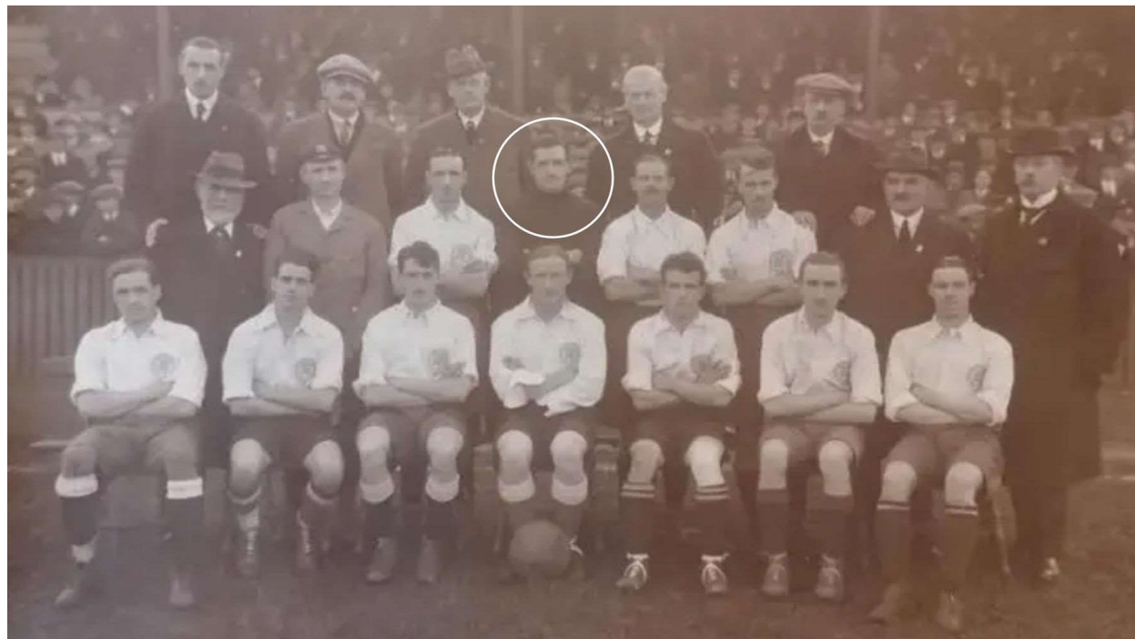
With the England amateur team that beat Ireland 4-0 on 13 November 1920