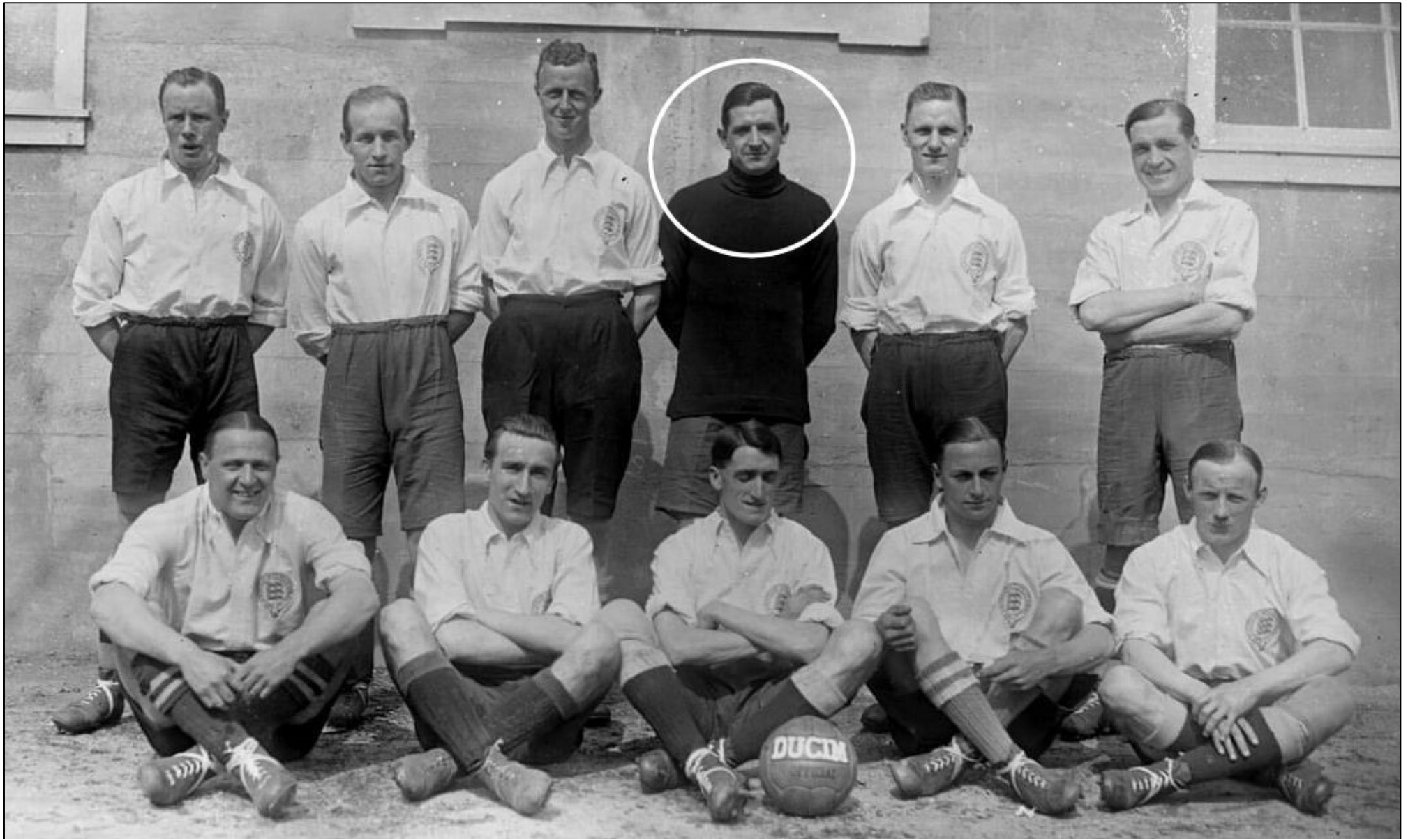
With the amateur England side that lost 2-1 to France in Paris on 5 May 1921