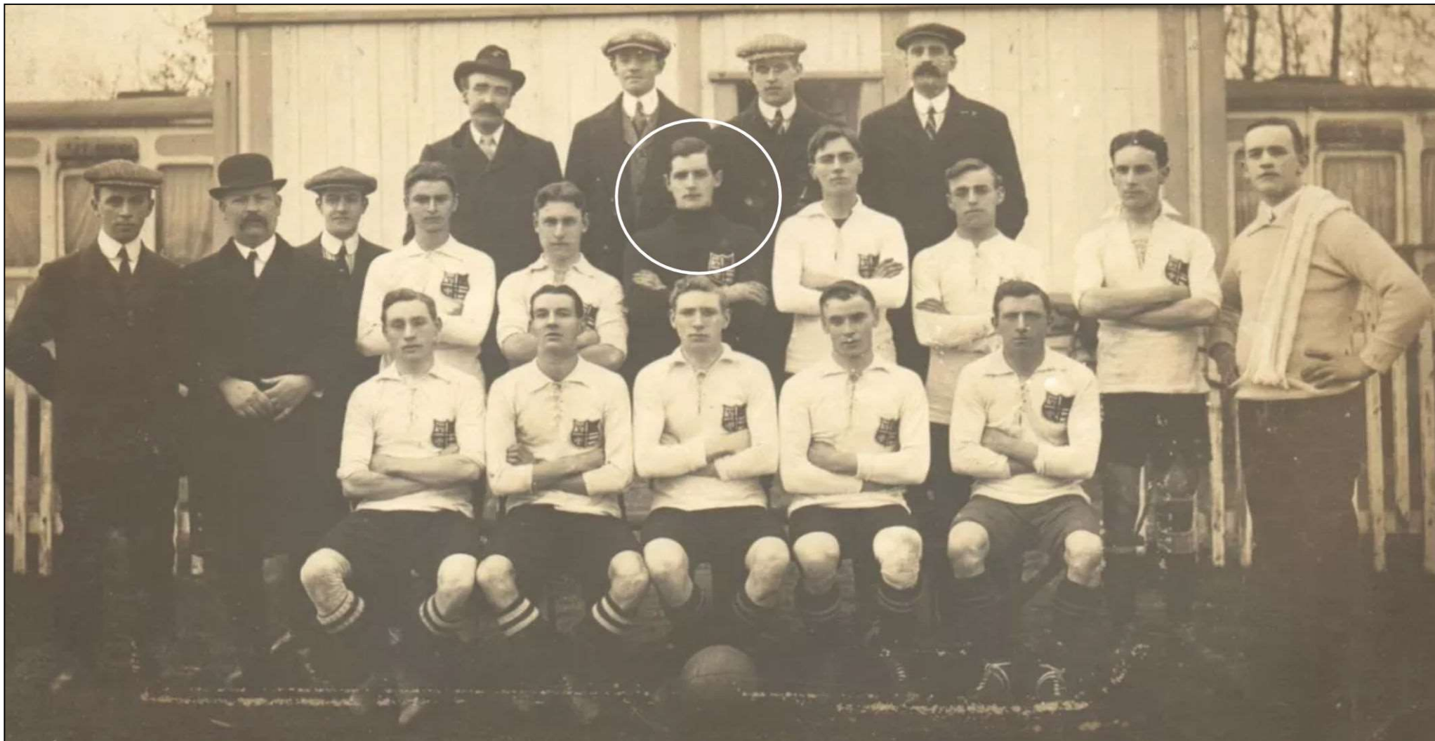
Croydon F.C. ( not Croydon Common) 1912-13