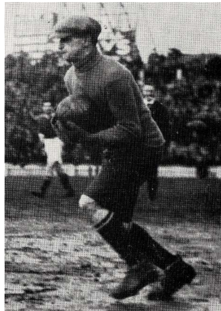
Playing for England in 1921