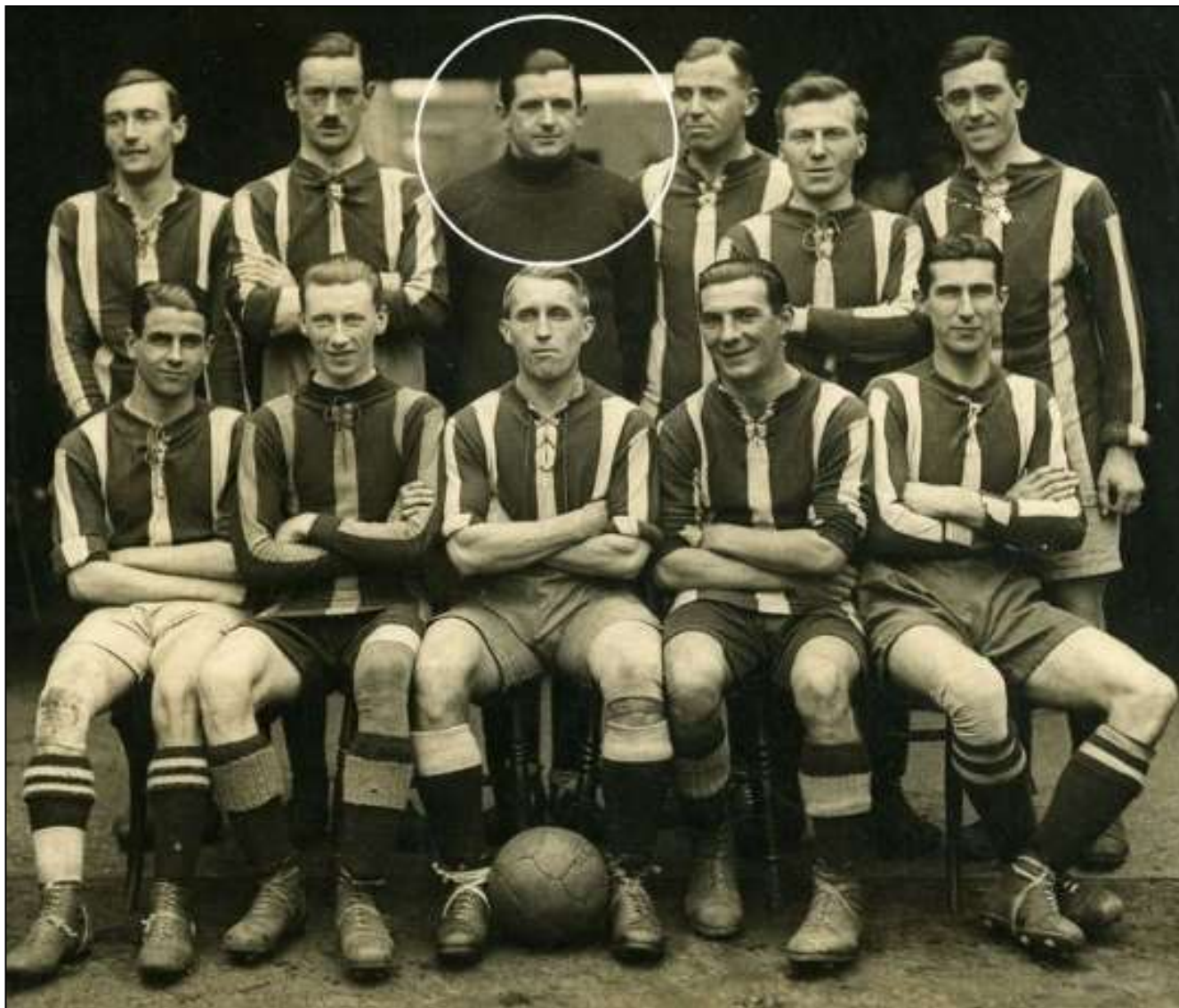
The Dulwich Hamlet side that won the Isthmian League and Amateur Cup in the 1919-20 season