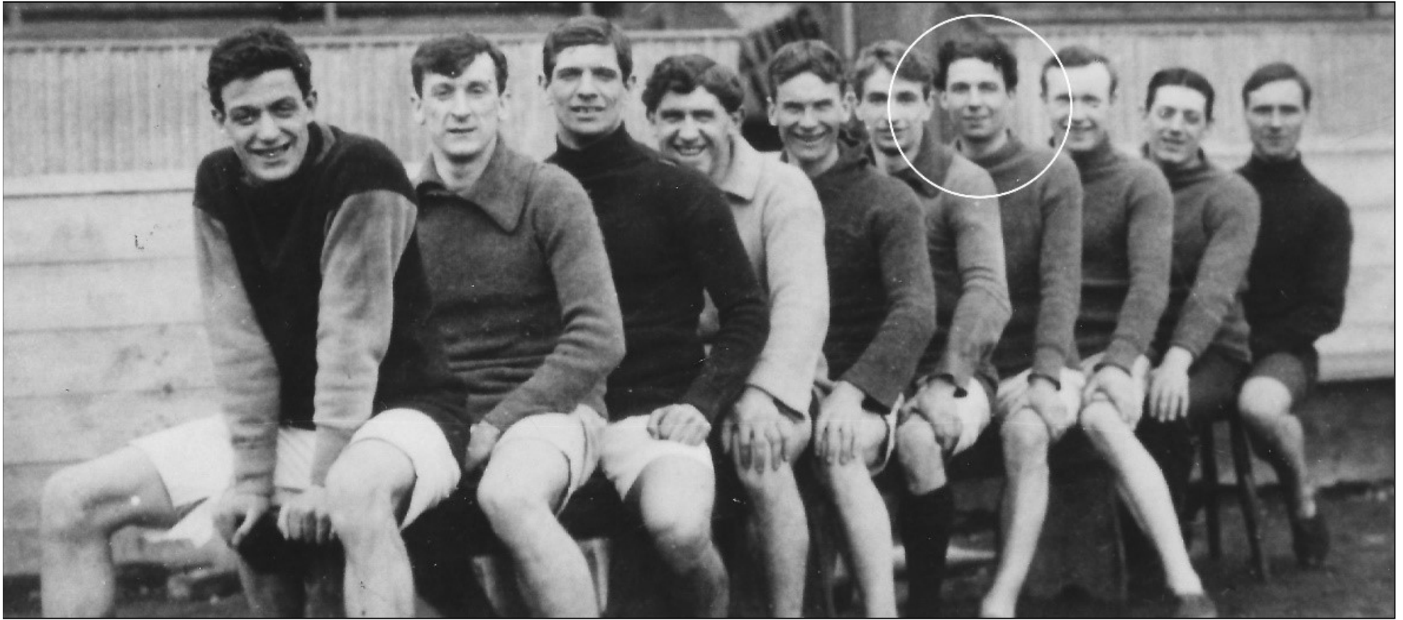
At Croydon Common