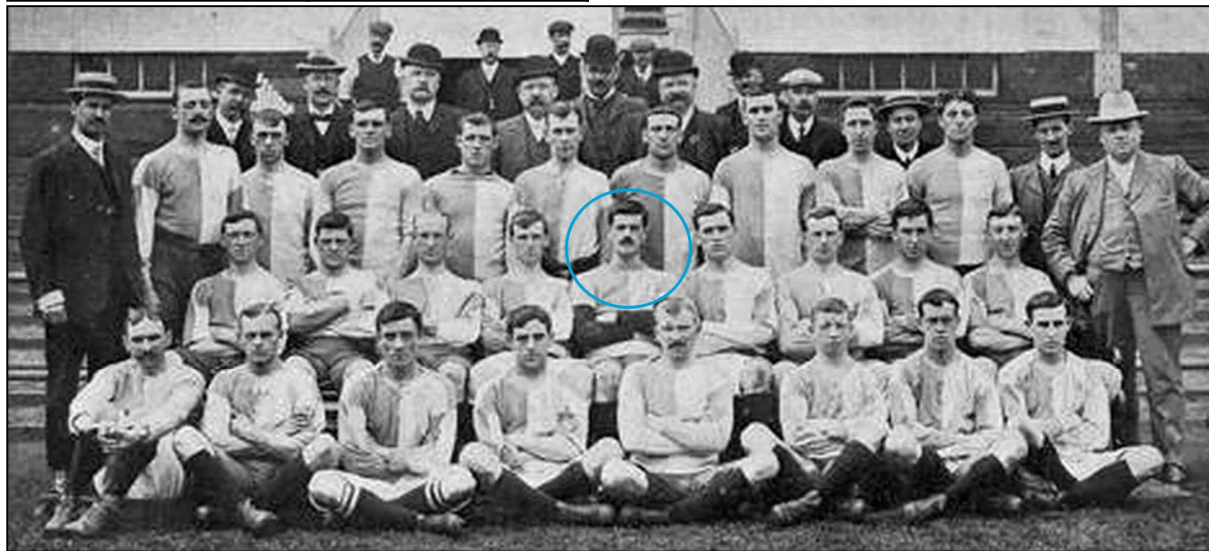
Blackburn Rovers c.1906-07