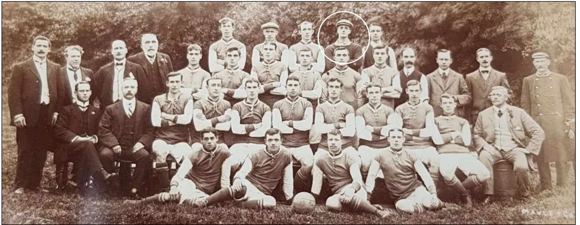
Coventry City 1909-10