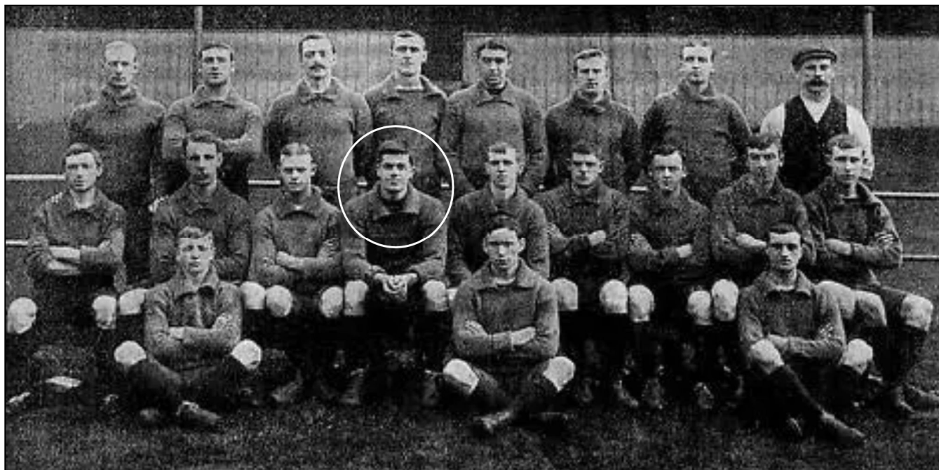
Blackburn Rovers 1906-07