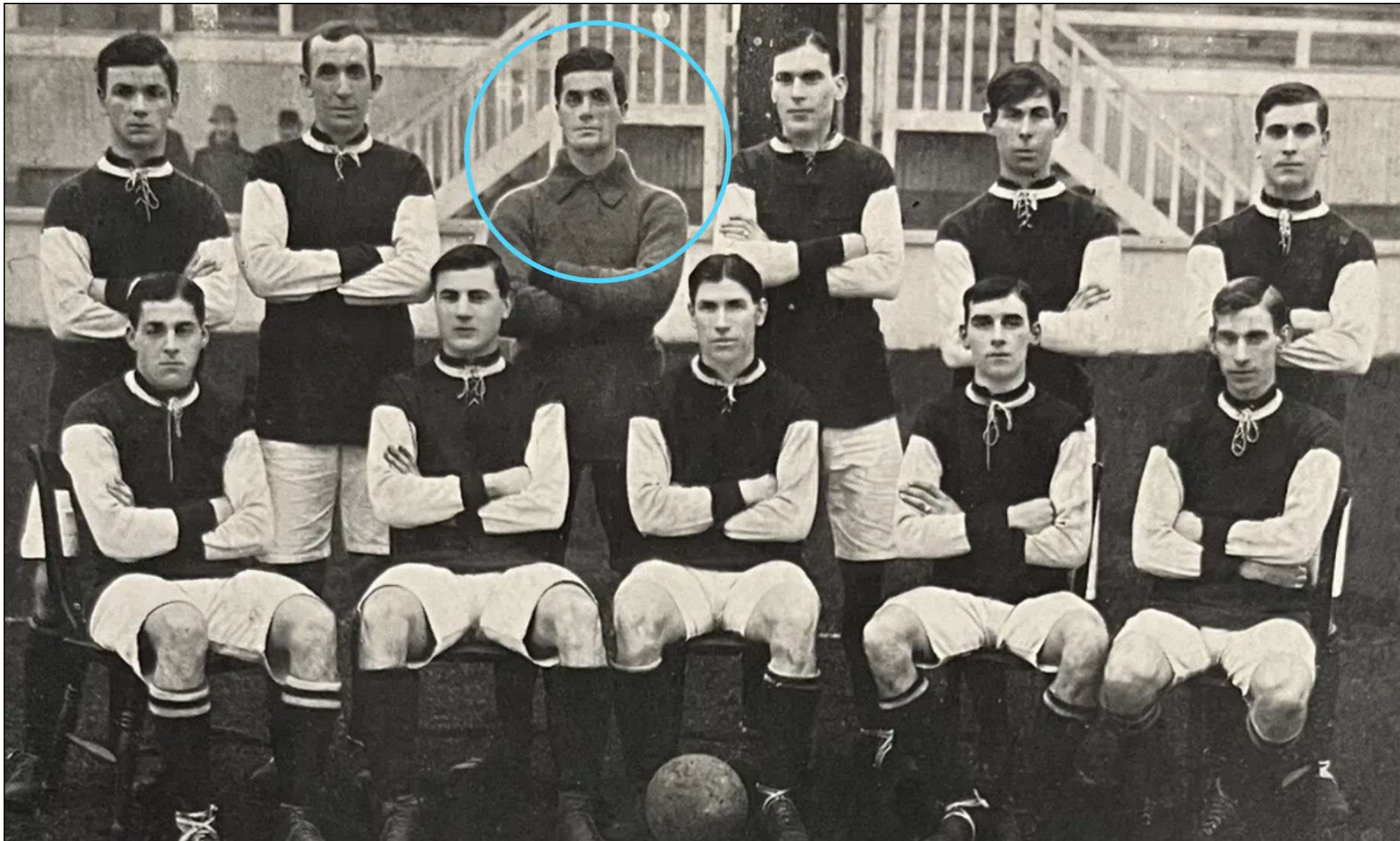
Coventry City 1910-11