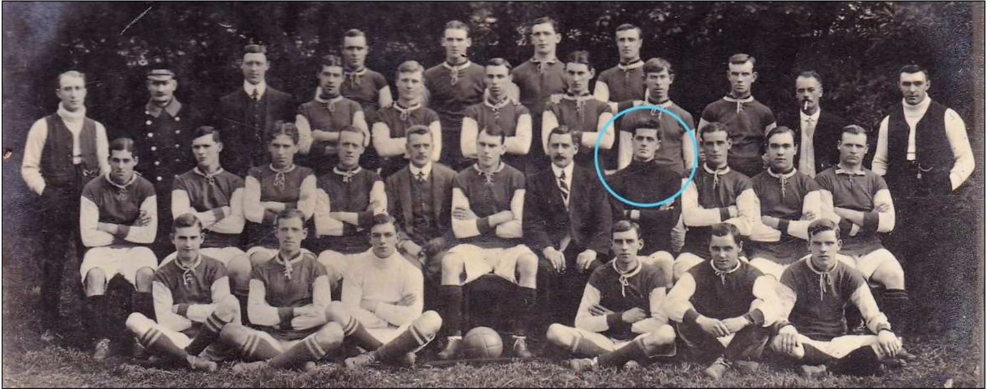
Coventry City 1912-13