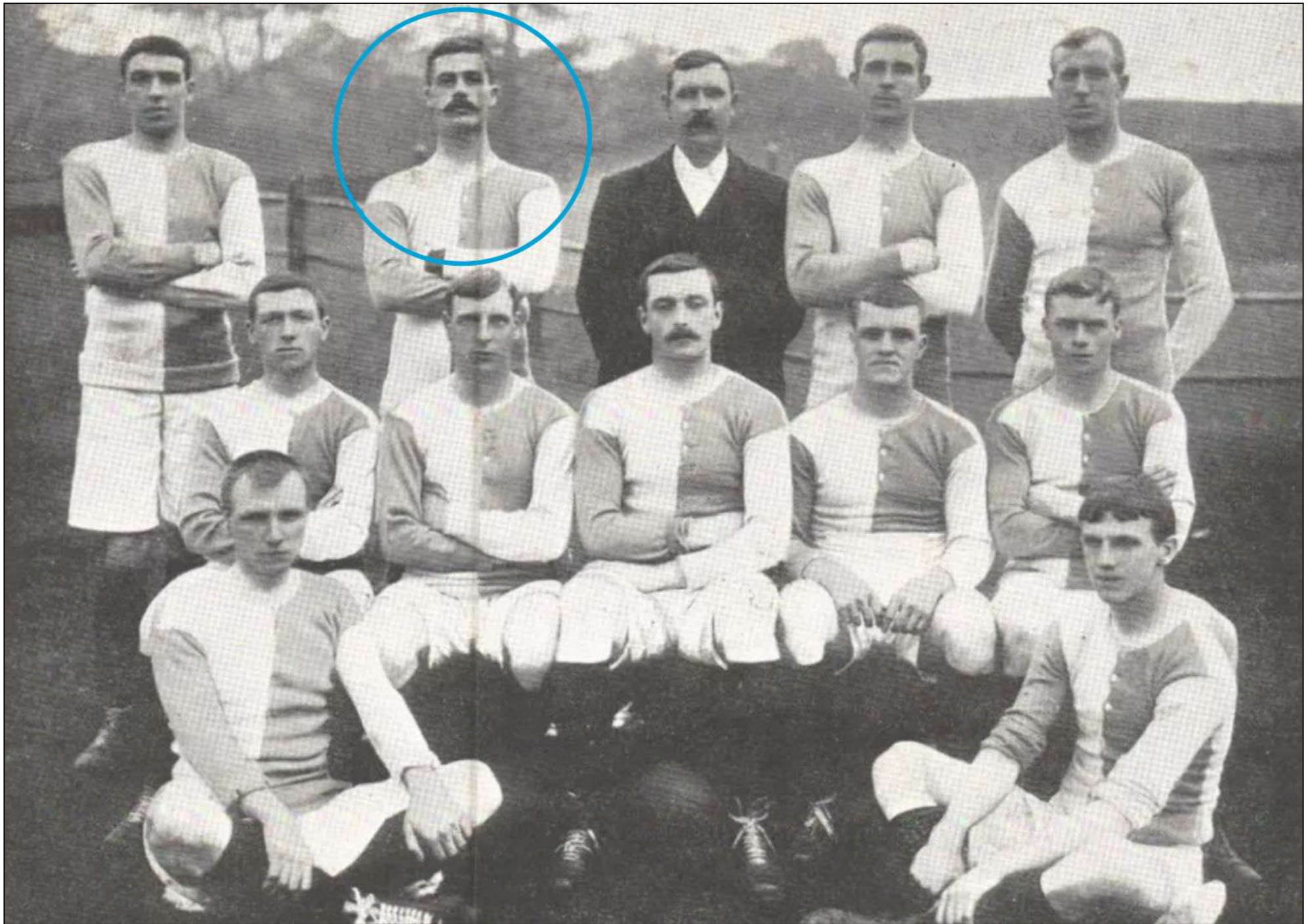
Blackburn Rovers c.1905