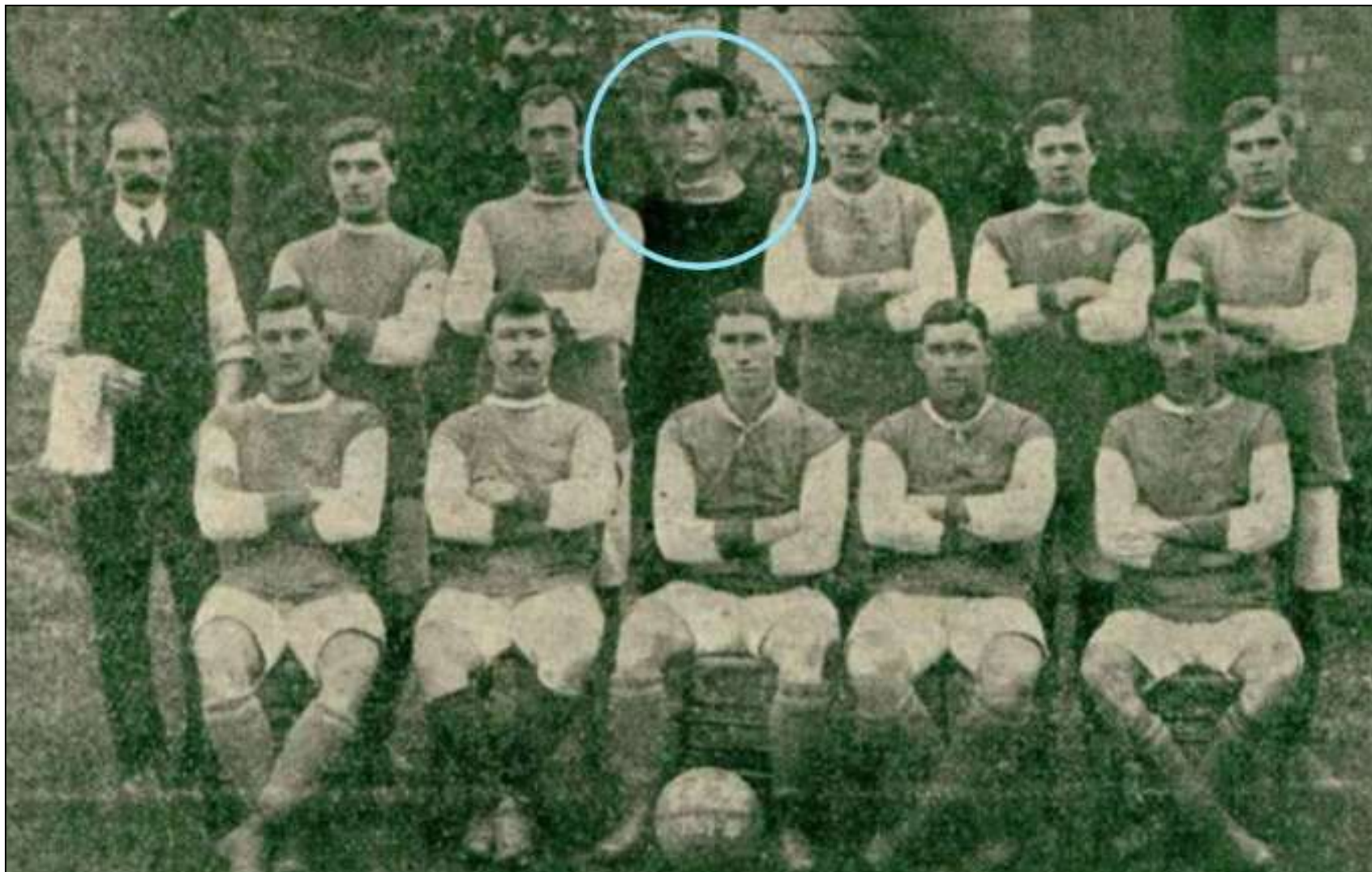
Coventry City 1909-10