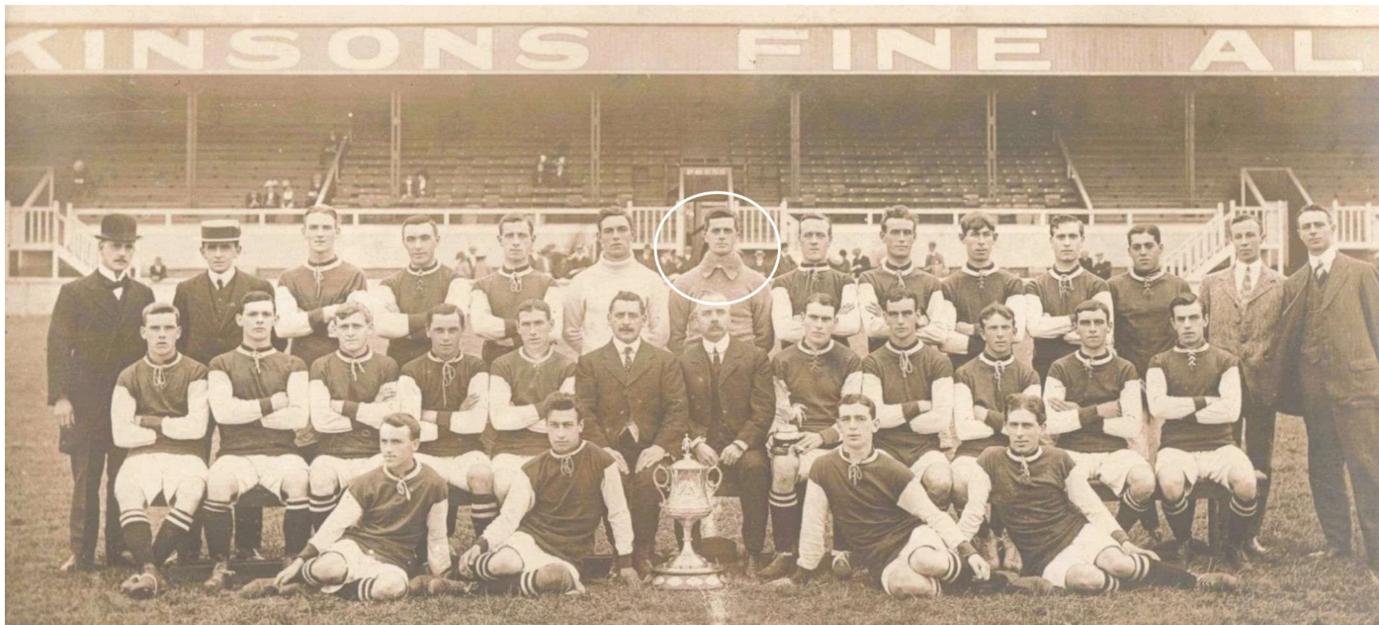
Coventry City 1911-12