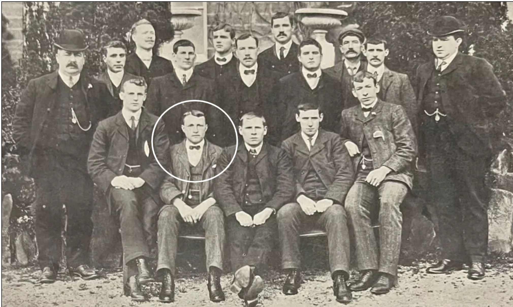
Bristol City 1905-06