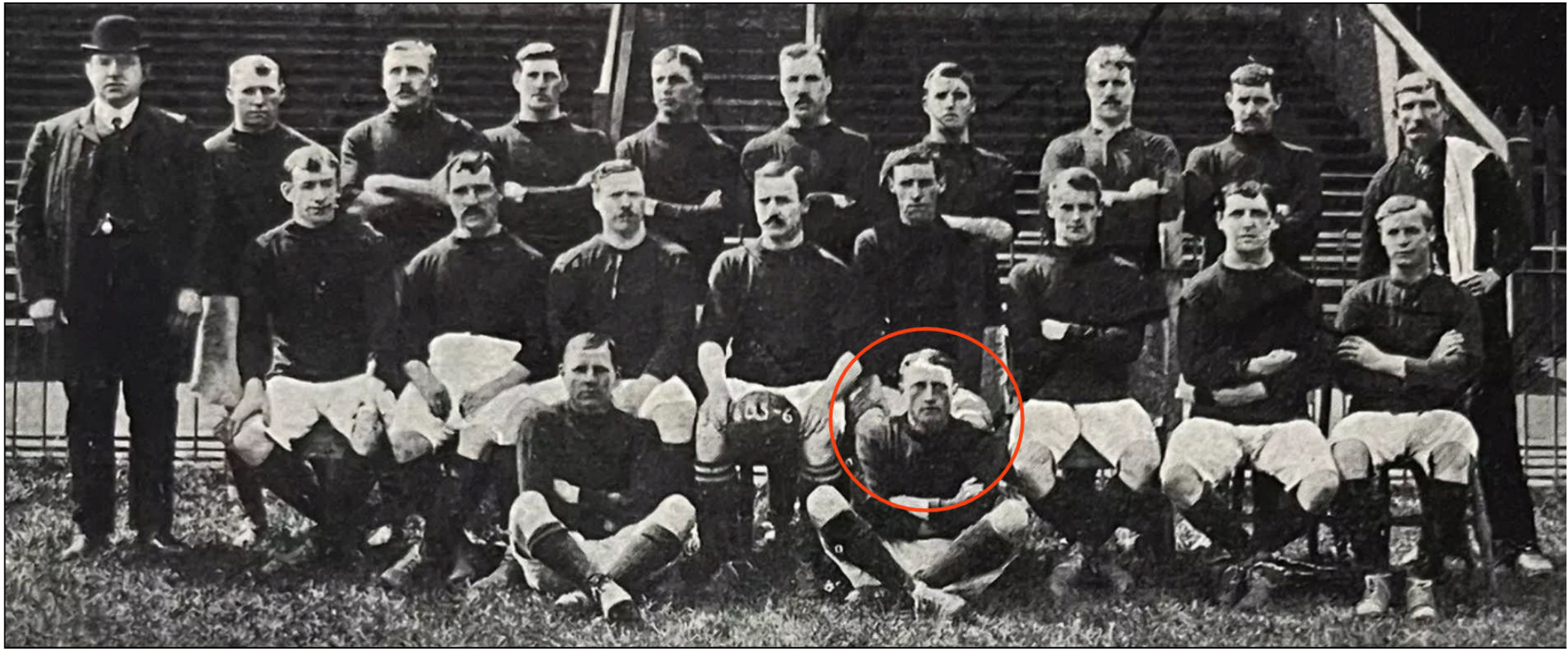
Bristol City 1905-06