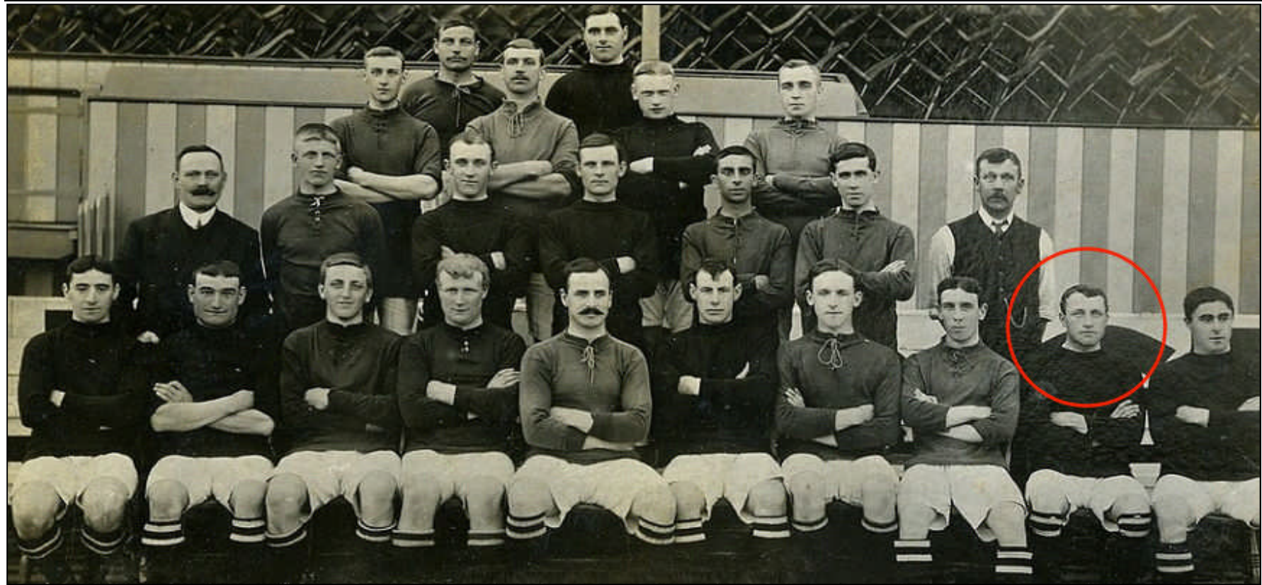
Swindon Town 1908-09

His style was a mixture of dash and sagacity