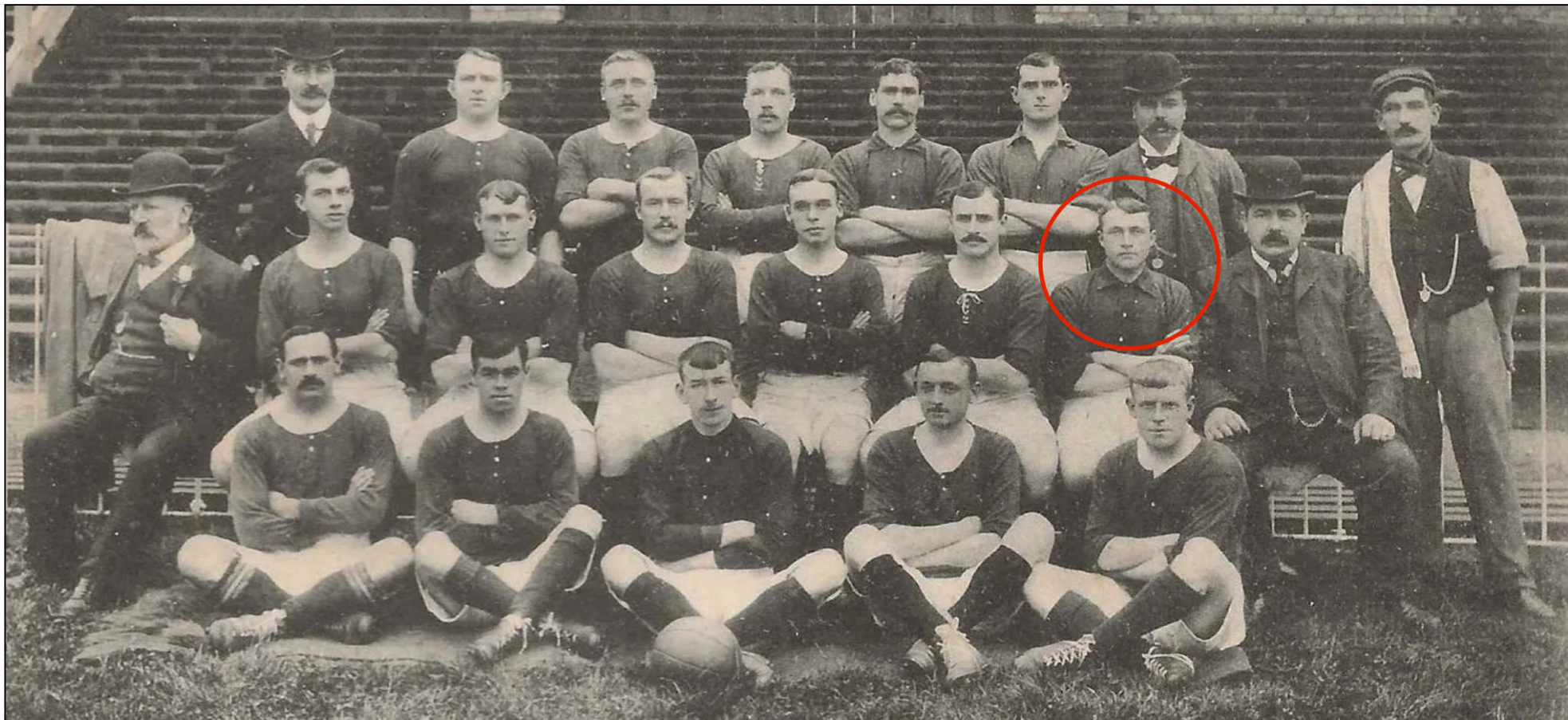
Bristol City 1904-05