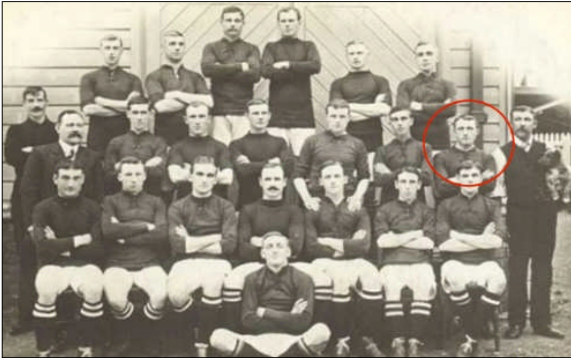
Swindon Town 1909-10