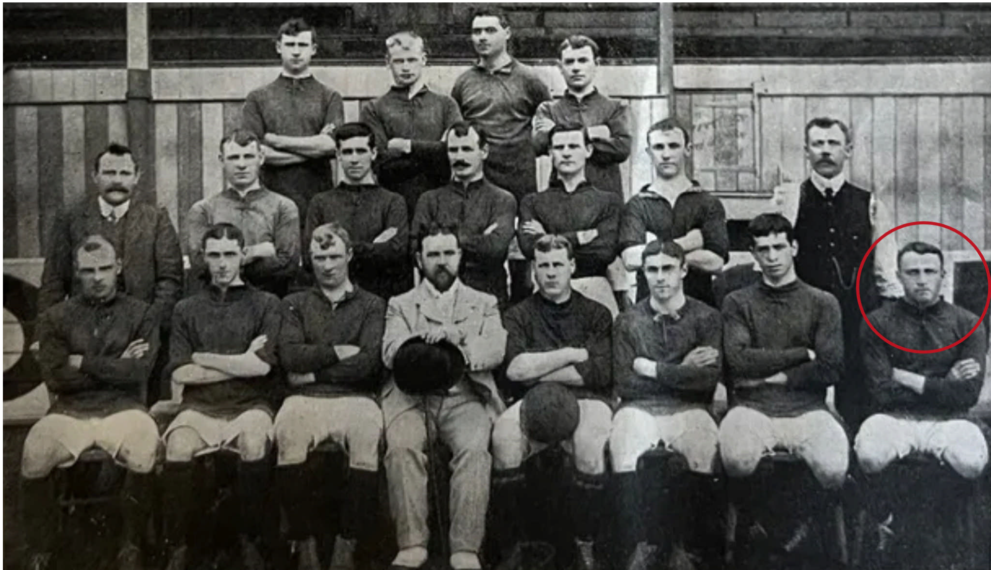
Swindon Town 1907-08