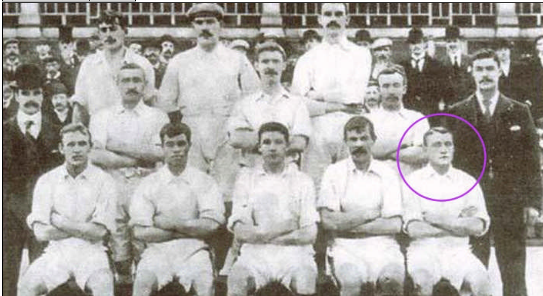
West Ham United 1900-01