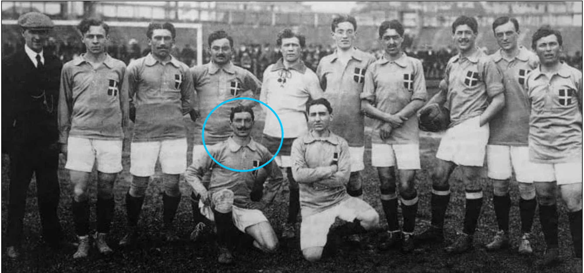
With the Italian national team that played Belgium in 1913