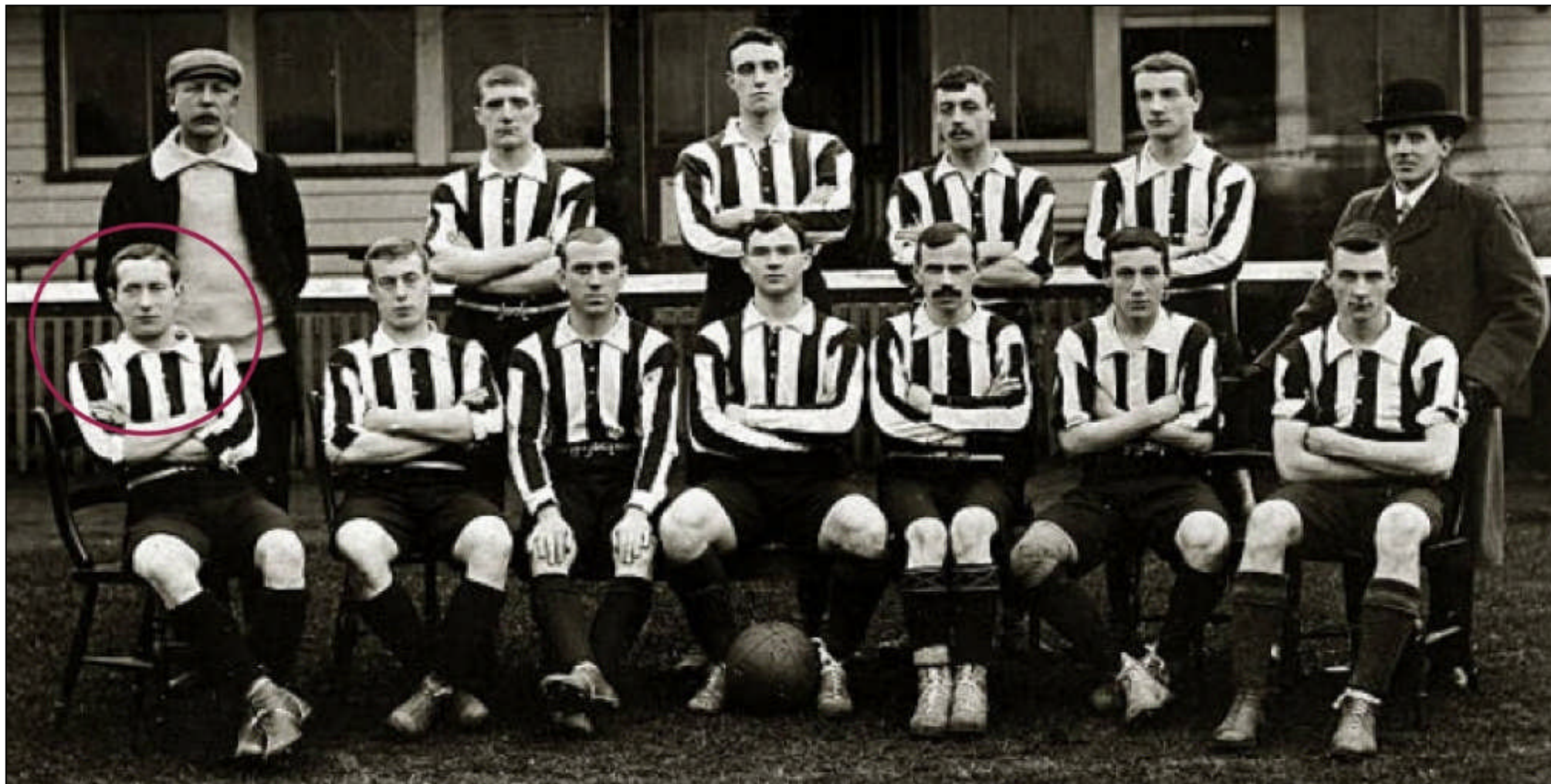
Northampton Town 1902-03