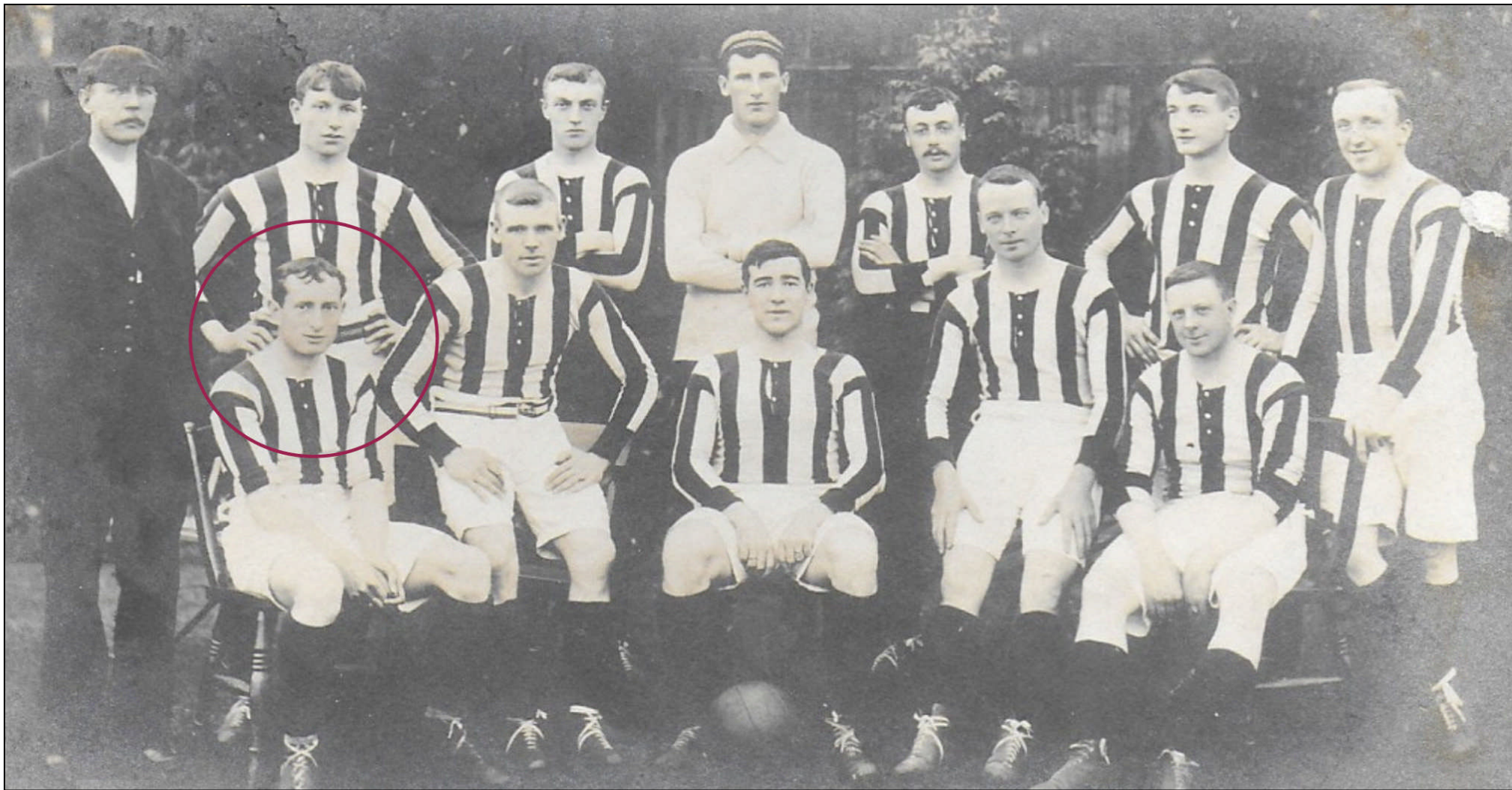
Northampton Town 1905-06