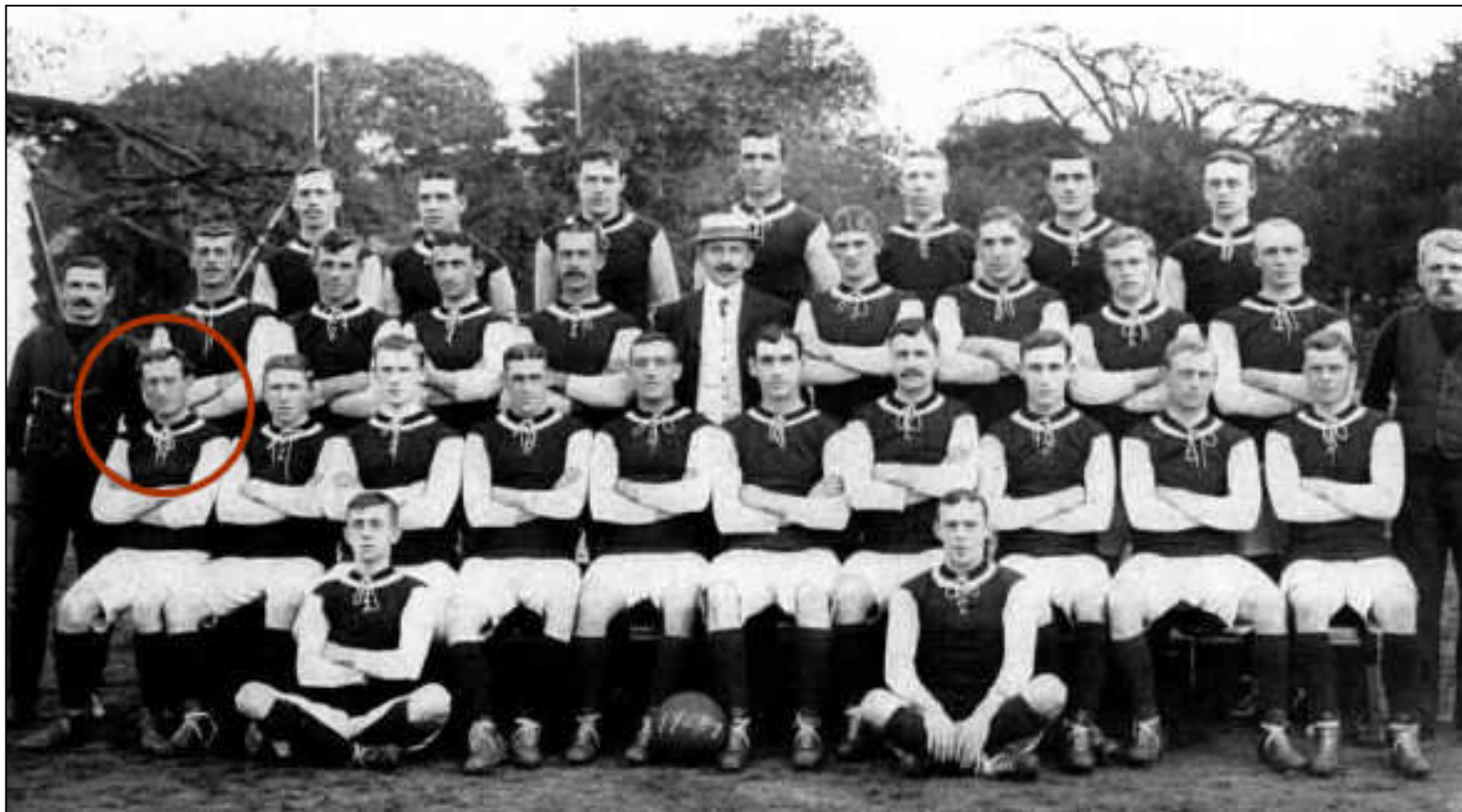
West Ham United 1908-09