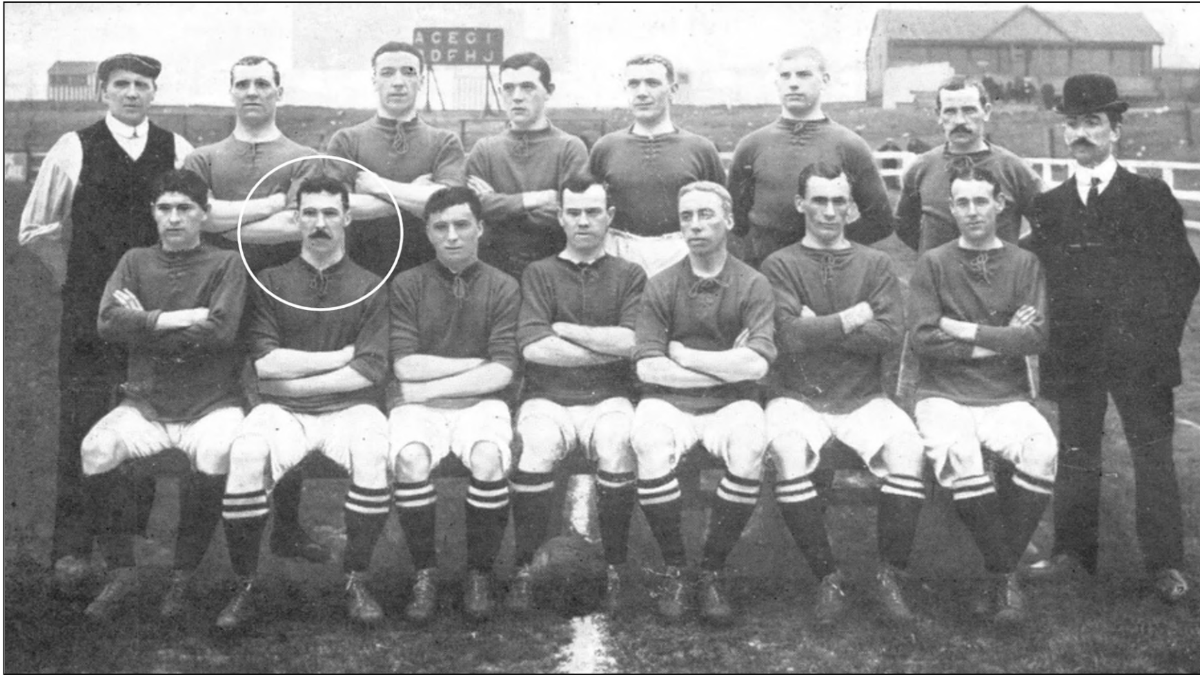
Oldham Athletic 1907-08