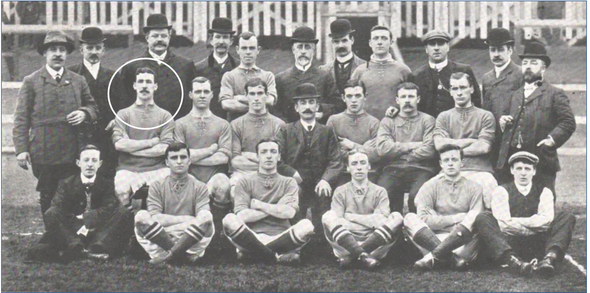
Oldham Athletic 1907-08