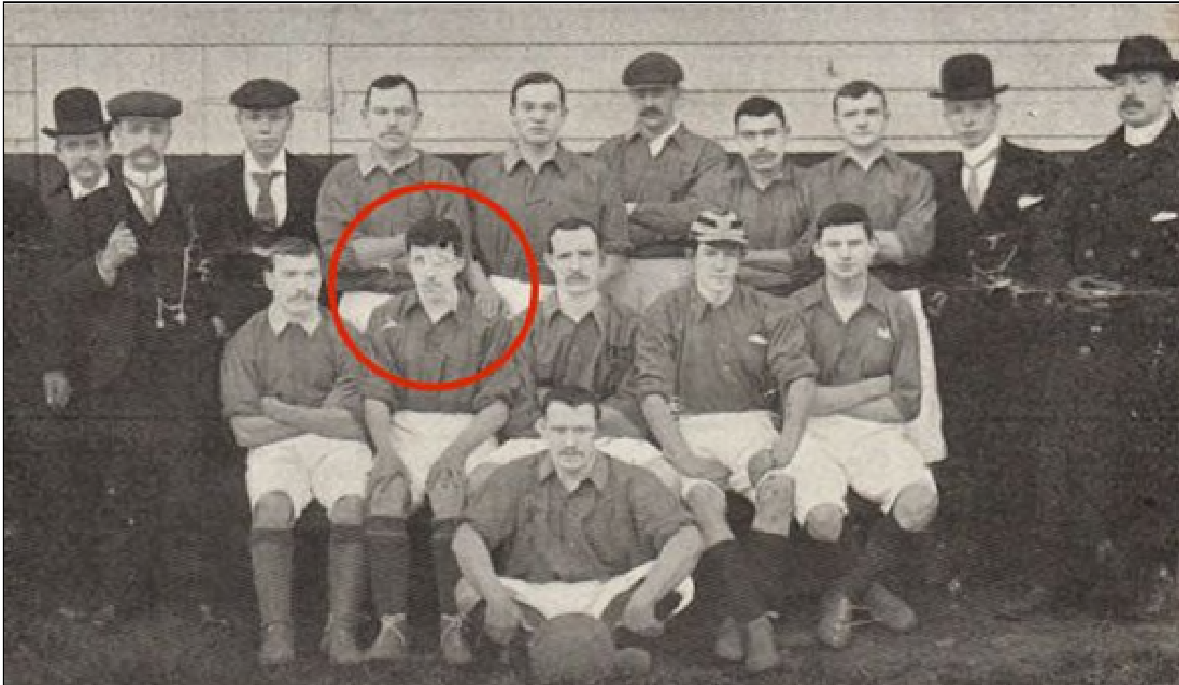
Crewe Alexandra 1901-02