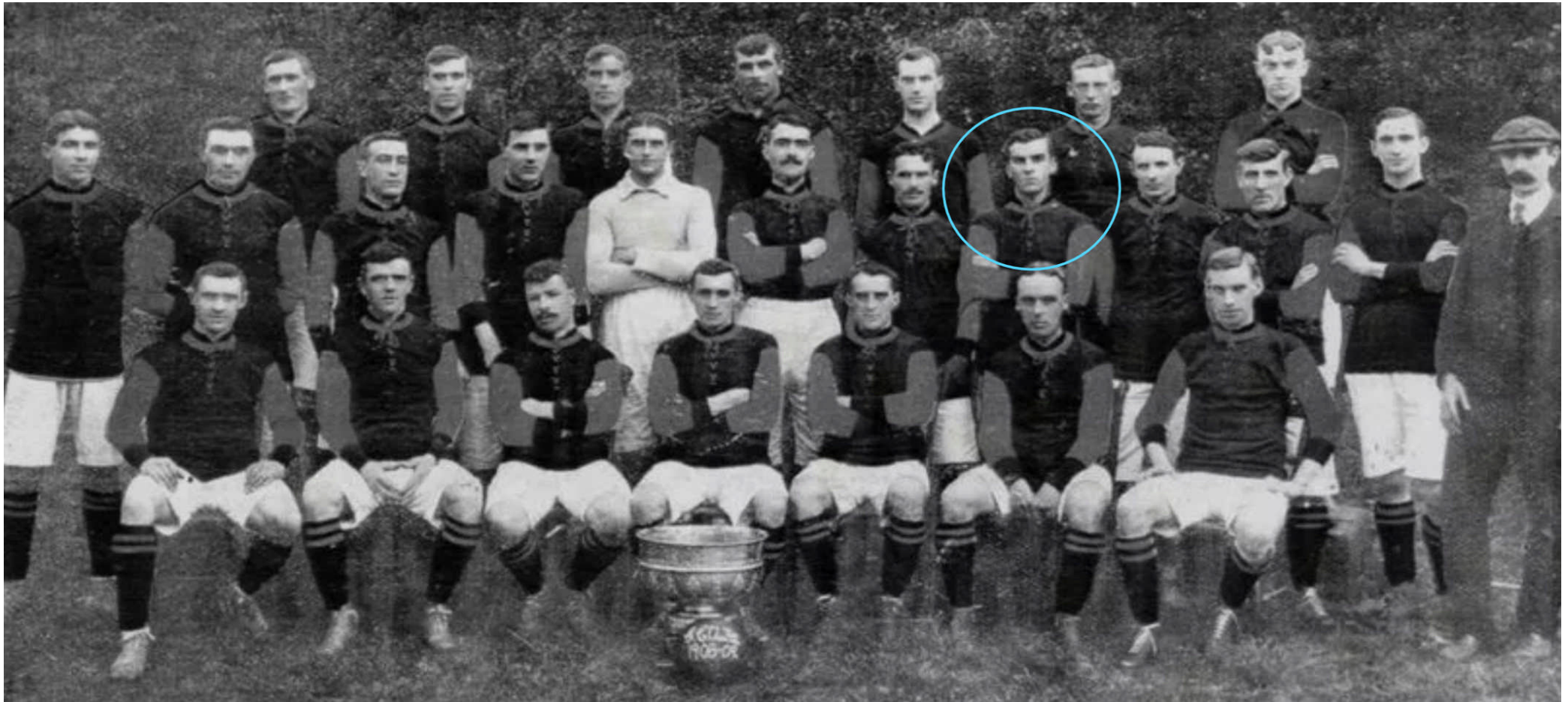
Coventry City 1908-09