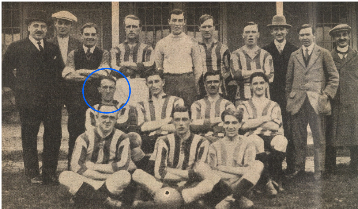
Epsom Town 1923-24