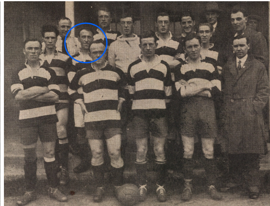
Epsom Town 1924-25