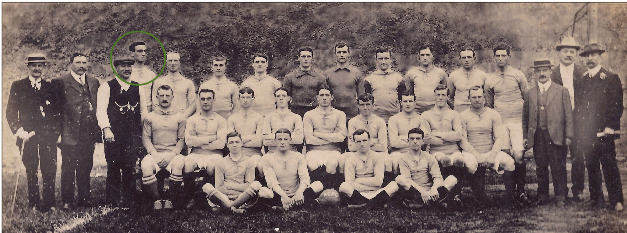
Norwich City 1910-11