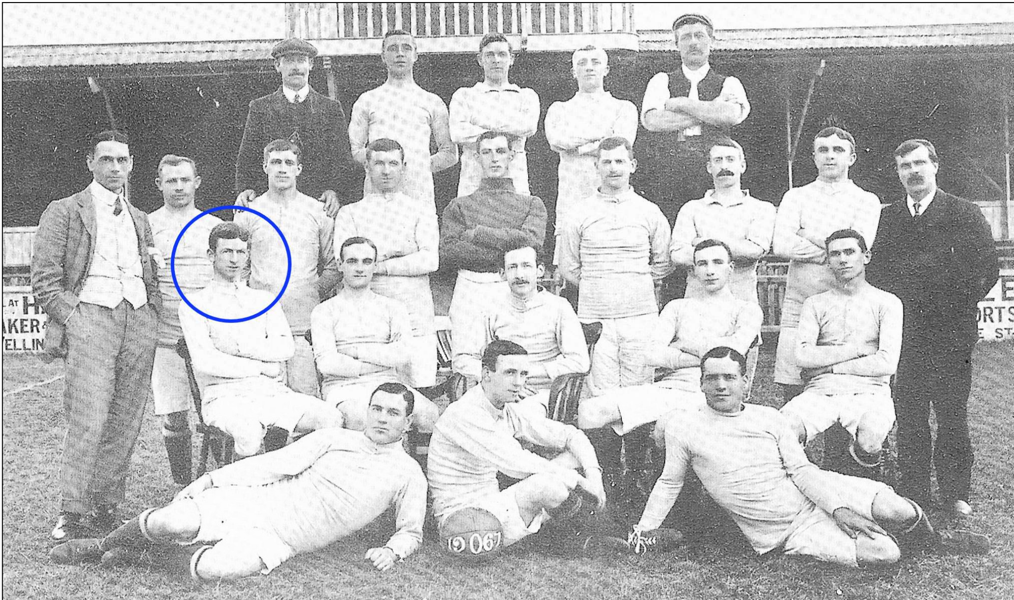
Luton Town 1906-07