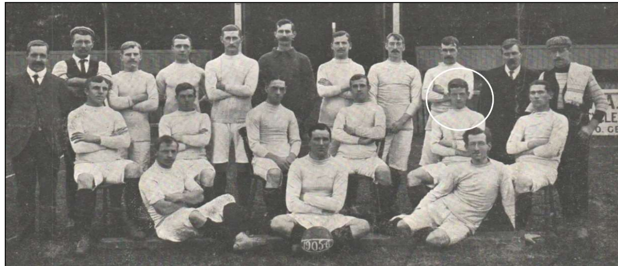
Luton Town 1905-06