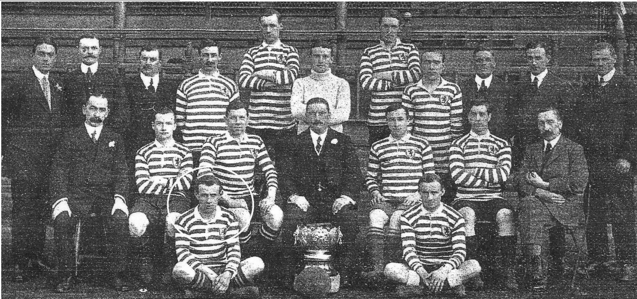
London Caledonians 1913-14