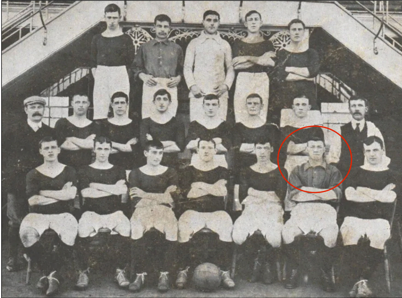
Swindon Town 1906-07