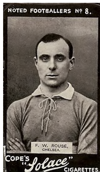
Copes Solace 1910