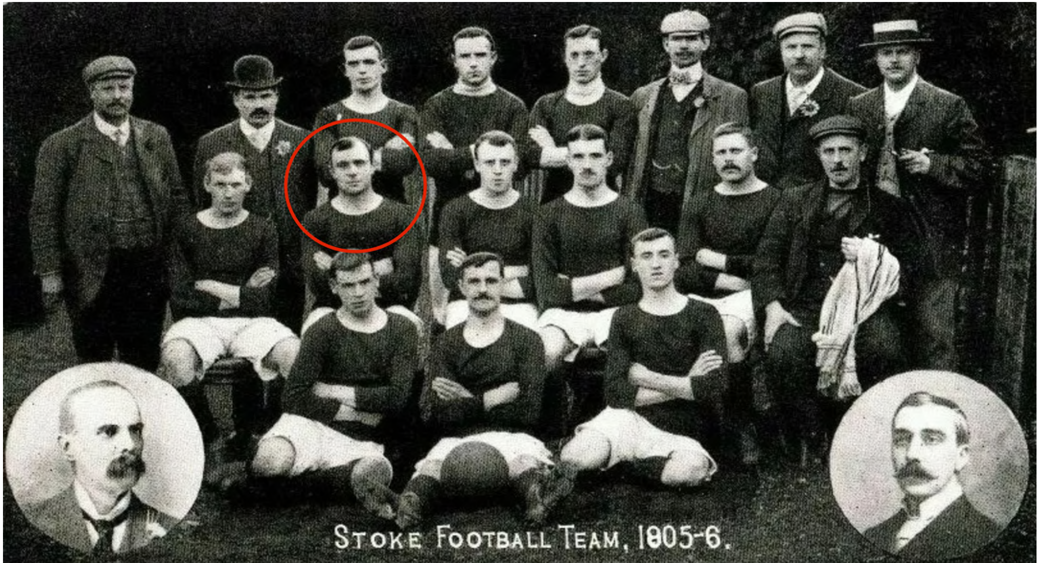
STOKE FOOTBALL TEAM, 1905-6.