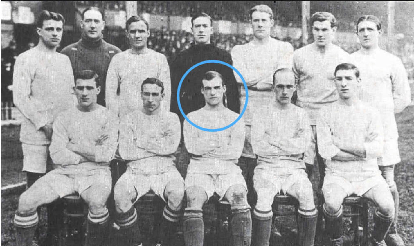
Chelsea F.A. Cup Final 1915