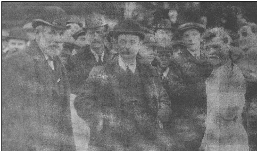
With his father and grandfather at a Croydon Common match