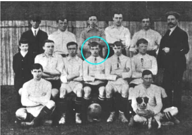
Croydon F.C. 1909-10