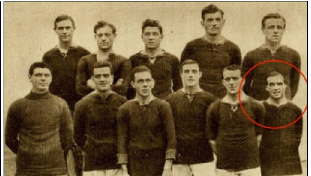
At Charlton Athletic