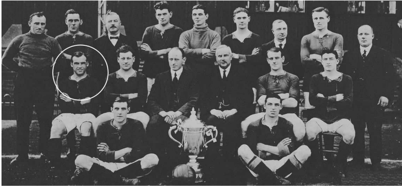
Charlton Athletic 1922-23