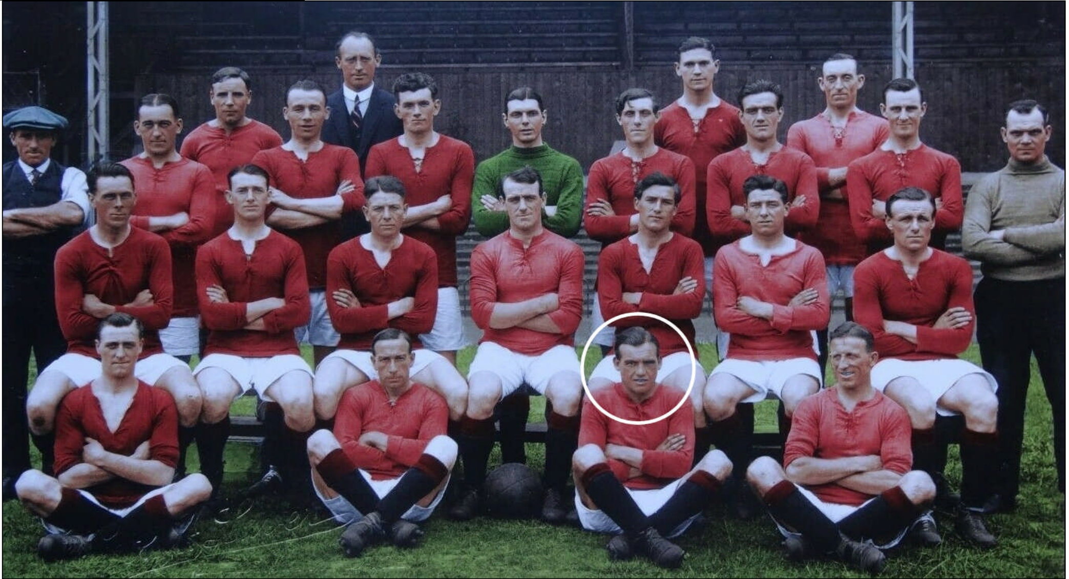
Charlton Athletic 1922-23