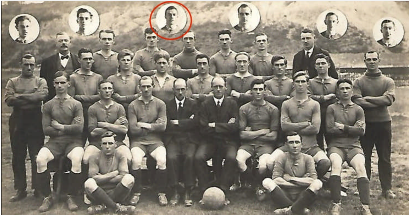
Charlton Athletic 1921-22

Was apparently a very good billiards player