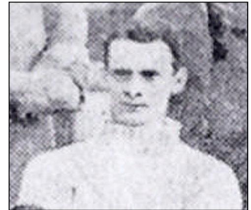
At Croydon Common in 1912-13