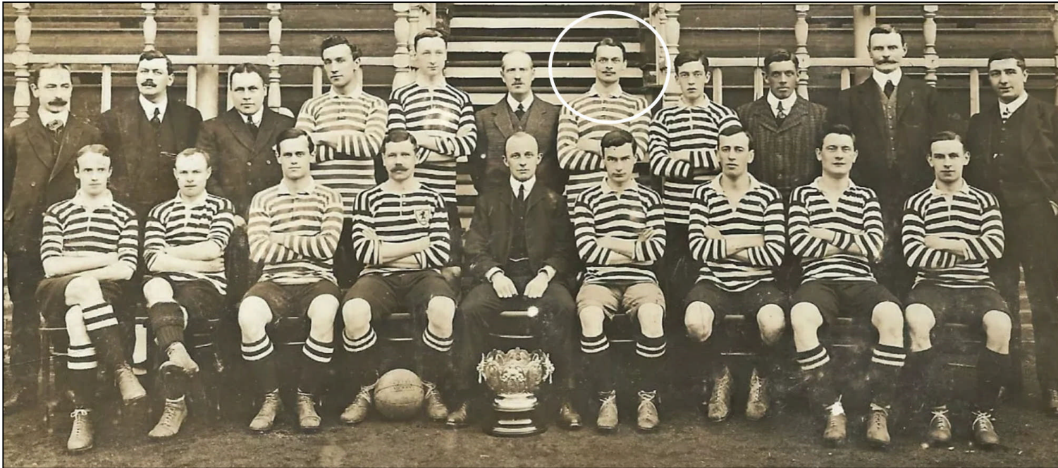
London Caledonians 1908-09

He is a jolly good fellow and a fine player (Woolwich Arsenal Handbook 1914-15)