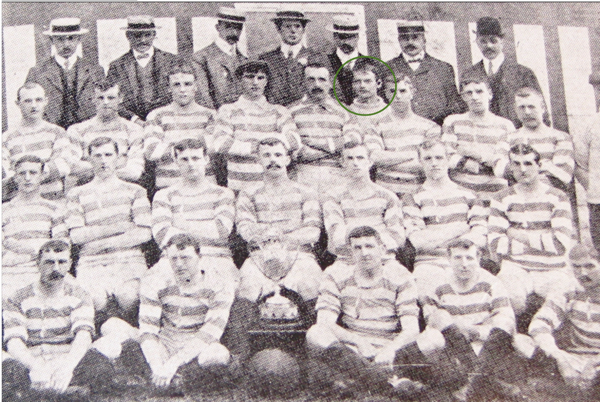
Queens Park Rangers 1904-05