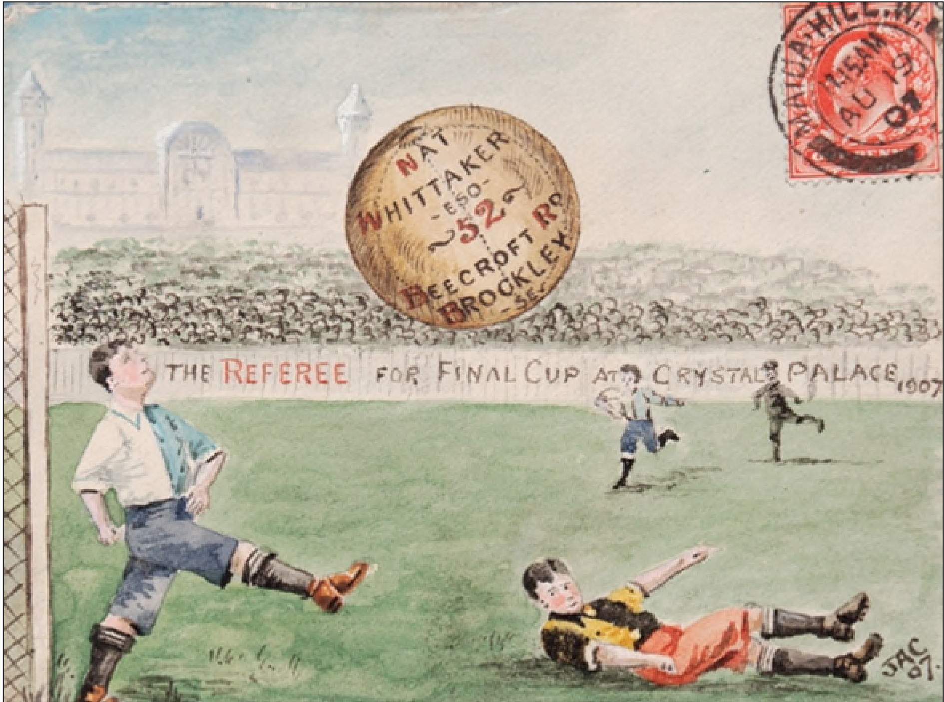
The envelope of a letter sent to him a few months after he had refereed the 1907 F.A. Cup Final